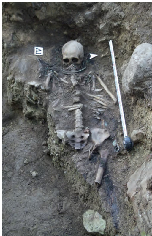
Fig. 5. Burial no 4 (2010). Jn 5. Matus nr 4 (2010).

The belt with round fittings in the Valjala burial no 4 (2010) has a counterpart in burial no 152 at Pada (Tamla 2011c), but a similar one has also been found in grave no 7 near St Peter's Church in Riga, where it is dated to the end of the 13th century (Pāvele 1959). Similar finger-rings in the deposit of Lõhavere in southern Estonia have, however, been dated to the first quarter of the 13th century (Laul & Tamla 2014, 87–90). We can conclude that the woman in burial no 4 (2010) in Valjala was presumably buried around the middle of the 13th century, and with her, among the other things, a pin was placed that originally had belonged to her mother or some other deceased relative.