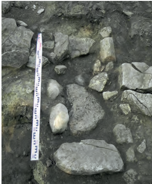
Fig. 9. Stones covering and lining burial no 14 (2010). Jn 9. Matust nr 14 (2010) ääristavad ja katvad kivid.

The position in the grave, below the upper edges of the almost vertical lime stones suggest that the bones of 13a were placed in the clearly indicated grave, or deposited in the upper layer of the grave fill intentionally. It is also difficult to see how the skeleton could have been destroyed by later burials, when framed and covered with stones.