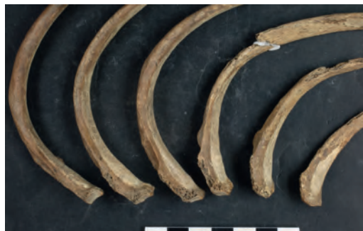
Fig. 15. Rib periosteal lesions: visceral view of the left ribs.

In addition to a possible case of pulmonary tuberculosis, the skull of burial no 13a (2010) was found upside down in the grave of burial no 13 (2010). The left parietal bone of the skull presented with a hole indicative of skull surgery (Fig. 17). For a long time, there had been no finds of trepanned skulls in Estonia, but during the last couple of years, a few interesting cases have been found. Trepanation is a surgical procedure in which the soft tissues of the skull and the underlying bone are cut and removed. The