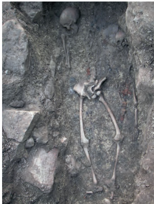
Fig. 10. Burials no 15b and 15c (2010).

There were no other jewellery or bronze fittings fixed to the costume of the woman, but a number of artefacts and a garment with bronze decoration were uncovered under the skeleton. Under and aside the left hip there were big round silver sheet pendants and