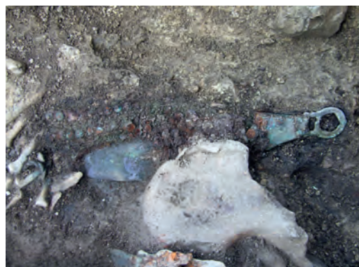
Fig. 6. Belt with a buckle and round fittings under the pelvis in burial no 4 (2010). Jn 6. Ümmarguste naastudega vöö koos pandlaga matus nr 4 (2010) puusa all.