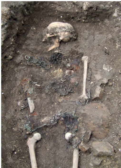
Fig. 7. Belt chain, belt, knife sheath and bronze decoration of an apron in burial no 8 (2010) after the bones have been removed.

Female, 40–45 years old, head to NW, stature 155.3 \pm 3.72 cm ( dex F ). Pieces of bark and/or wood were preserved in several places around the skeleton. No stones marking the grave were registered.