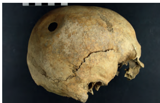
Fig. 17. A skull with trepanation found at Valjala church cemetery.

Jn 16. VII kaela- ja I rinnalülrikeha lahustuv haiguskolle.