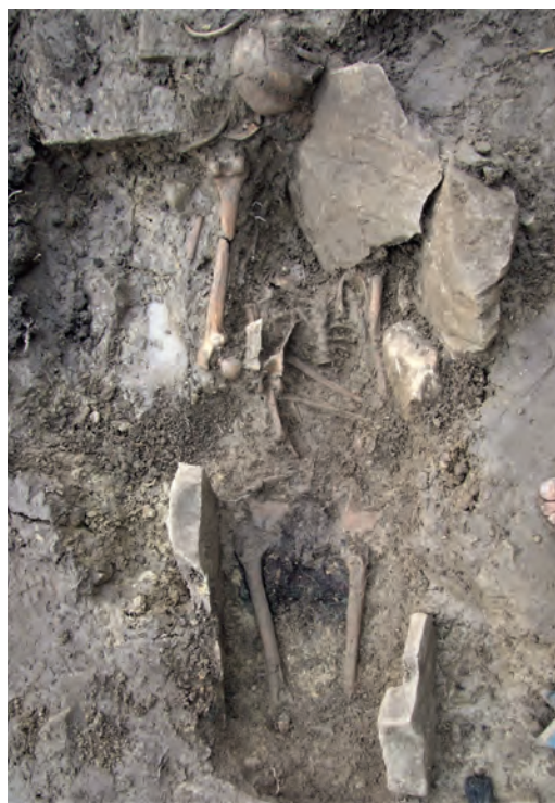
Fig. 8. Burials no 10 and 10a (2010). The skull of burial 10a can be seen in the upper layer of the stone cist, while the head part of burial no 10 is not uncovered yet. Under the femora the bronze decoration of a garment can be seen.

The belt-chain resembled the others in the Valjala graves and can probably be dated to quite a long period. The small cross-headed pin with joint terminals was a very common find in North Estonian 13th century graves, but also occurred in Saaremaa. Two such pins were, for example, found in burial no 13 at Karja, where they were dated to the 13th century. A pendant made of such a pin was recorded in the female burial no 7 at Viru-Nigula Church in NE Estonia where it could not be dated earlier than the second half or the end of the 13th century (Tamla 1991). The pin type is rare in stone graves, indicating that it probably was used mainly during the 13th century, after the 1220s, when people were not buried in Pagan stone graves any more.