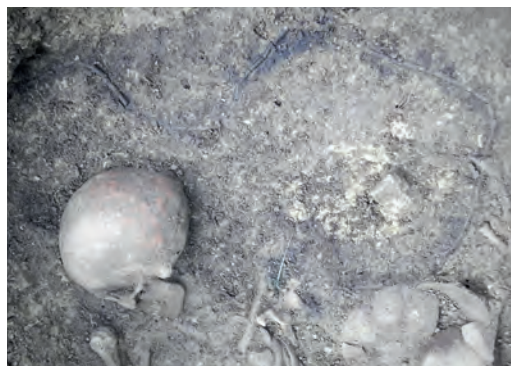
Fig. 11. Bronze decoration of a head-dress and a small double-spiral-headed pin in burial no 15b (2010).

Jn 11. Peakatte pronksilustused ja väike kaksikspiraalpeaga nõel matuses nr 15b (2010).