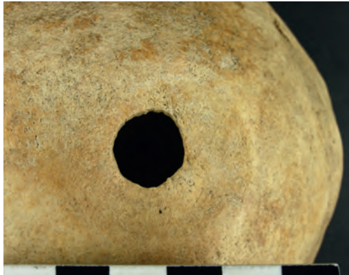
Fig. 18. The sharp edges of the wound indicate that the man did not survive the operation.

The trepanned skull found in Valjala is the oldest known skull with surgery marks found in Estonia. Unfortunately, the skull was found in a damaged grave where the skull was the only preserved part of the skeleton; the rest of the skeleton had been dislocated by later burials or earthworks. Most of the facial bones were also missing. Based on the protruding glabella, large mastoid processes, and the nuchal crest, the skull belonged to a male. Since the cranial sutures were completely fused on the skull's inner surface and partially fused on the outer surface, we can assume that the deceased was most likely an older adult (40+ years). On the inner surface of maxillary sinuses there was new bone caused by chronic maxillary sinusitis. Sinusitis can be caused by different respiratory infections. Respiratory infections may develop as a result of poor living conditions, air pollution (smoke), lack of hygiene, and polluted water (Krenz-Niedbala & Łukasik 2016, 103).