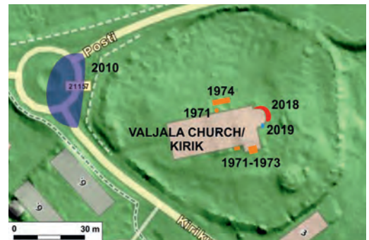
Fig. 1. Archaeological excavations around Valjala Church. Jn 1. Arheoloogilised kaevamised Valjala kiriku ümber.