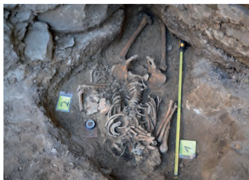
Fig. 13. Burials no 1 and 2 (2018). The leg bones of burial no 1 are cut by the round apse.

The pin represented an earlier version of pins as in graves no 1 (1971) and 2 (1973). A similar one has been found in grave no 52 at Pada cemetery, together with a coin minted between 1208 and 1212, as well as in grave no 80 at the same cemetery (Tamla 2011b). Pins of the same type in grave no 6 at Kukruse (Lõhmus et al. 2011) were recorded together with belt buckles as e.g. in the Valjala burials no 4 and 15b. Single pins of such type have