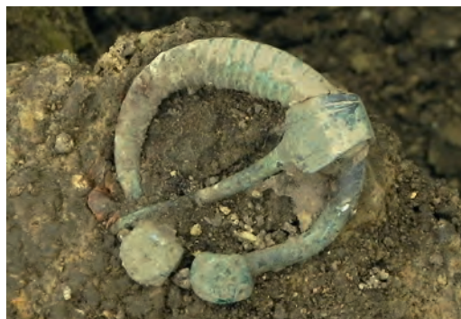
Fig. 4. Penannular brooch in burial no 3 (2010).

The penannular brooch in this grave represented a type that was widespread in several other Valjala graves, as well as in other 13th–14th century cemeteries in Estonia and Livonia. It had faceted terminals (in some other graves the terminals are faceted, but funnel-shaped), a grooved thicker middle part of the ring, and a widening end of the pin. A similar penannular brooch at Karja cemetery about 12 km north of Valjala was uncovered in burial no 7 together with a coin minted in 1238–1261 (Mägi 2002, pl. 108). Similar ones at Siksälä are dated to the time after 1300 AD (Valk et al. 2014), but in Pada