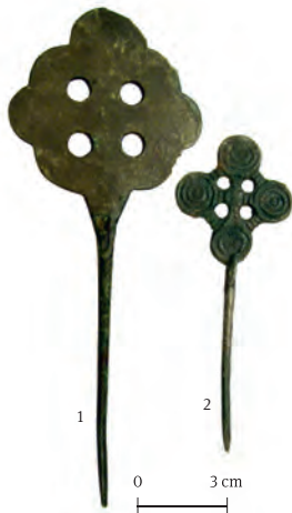
Fig. 3. Two 13th century pin types. 1 – pin with a flat blossom-shaped head from burial no 1 (1971), 2 – small cross-headed pin with joint terminals from burial no 10 (2010).

Jn 3. Kaks 13. sajandi ehtenõelatüüpi. 1 – lameda õiekujulise peaga nõel matusest nr 1 (1971), 2 – väike ühendharuline ristpeaga nõel matusest nr 10 (2010).