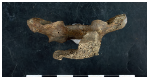
Fig. 16. Lytic destruction of the seventh cervical vertebra and first thoracic vertebra.

Jn 15. Luuümbrise põletik roietik sisepinnal.