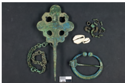
Fig. 14. Artefacts from burial no 1 (2018).