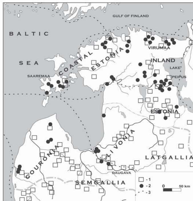
Figure 1. Distribution of silver hoards and hill-forts in the northern half of the Eastern Baltic.

however, at the same time marked by other archaeological sites and, starting from the ninth century, by numerous dirham finds. Especially noteworthy are several hill-forts with adjacent settlements along the North-Estonian coast and the south-eastern coast of the Saaremaa Island, both marking the main communicational routes in early Viking Age (Figure 1) 9 .