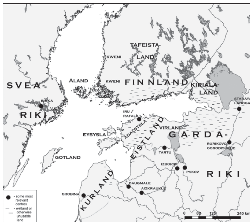
Figure 3. Place names and most important Viking Age centres around the northern half of the Baltic Sea.

circumstances of the Viking Age — they had to ask them back soon afterwards, according to the chronicler, in order to stop fighting between themselves. Whatever the real situation was, some Swedish supremacy was thereupon established in the territory of the later state of Novgorod.