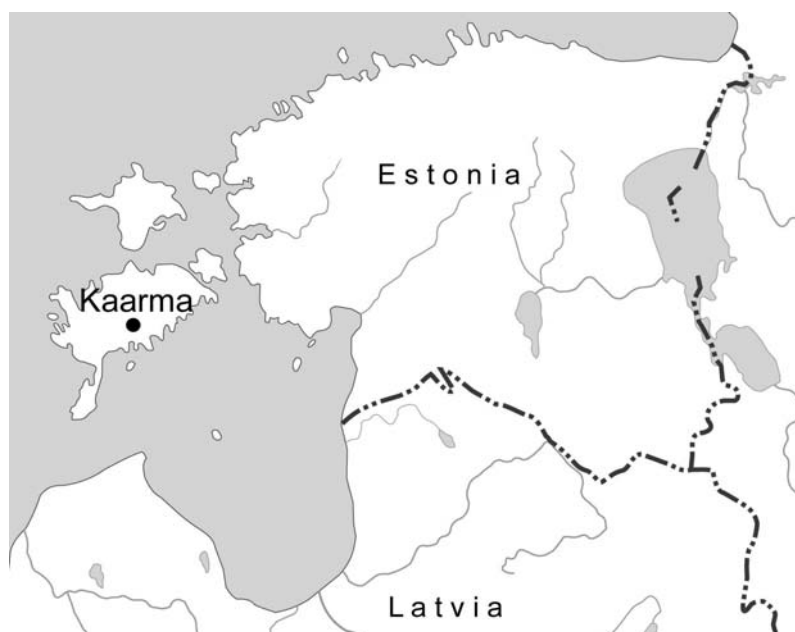
Fig. 1. Location of Kaarma. Drawing by Kersti Siitan

Kaarma stronghold, that was known as the administrative centre of pre-historic Saaremaa, is located about 100 meters away from the church and the parsonage (Fig. 1) 1 . The stronghold itself was situated by the River Põduste. The estuary of the River Põduste formed a narrow gulf, cutting deep into the inland of the island. It is supposed that an early port of the Kaarma inhabitants was situated by the gulf, that probably yet in pre-historic times was moved to Kuressaare to the location of the later residence of the Oesel-Wiek Bishop (Mägi 2004b, 151). Numerous Late Iron Age stone cairns testify of that the Kaarma region was densely populated (Mägi 1998, 153f; 2002b, 203). Additionally, three hoards have been found in the area: coin hoards from the 10 th and beginning of the 12 th century 2 and the Piila treasure of coins and silver ornaments from approximately 1200 (Molvõgin 1994, 520–527; Leimus 2003, 150ff). Judging by the density of coin hoards found, the island at the turn of the 12 th and 13 th centuries has probably been a place where the Gotland and/or German merchants spent their winter (Leimus 2002a, 1599, Fig. 4).