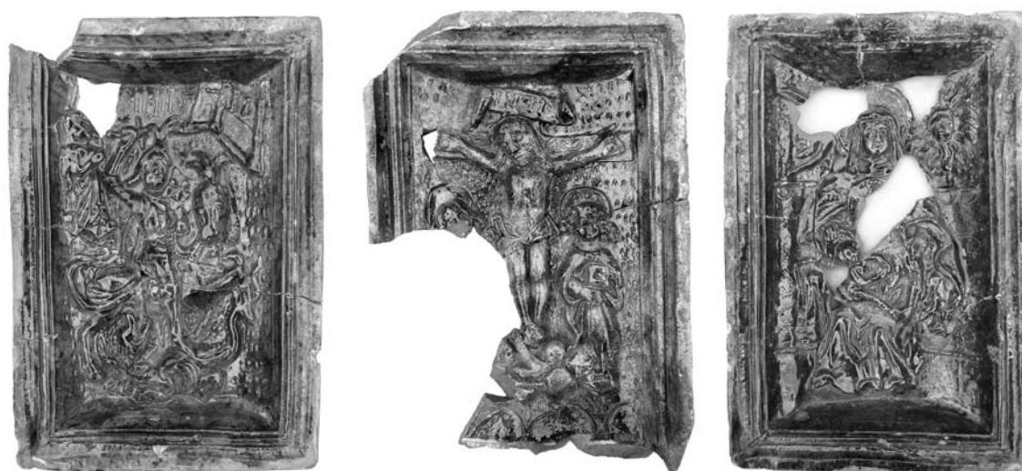
Fig. 3. Early 16 th stove tiles from the parsonage cellar.