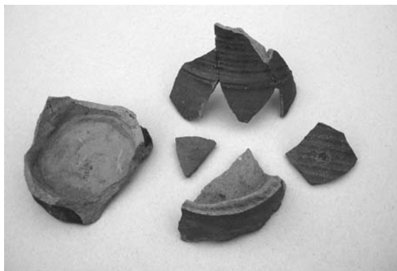
Fig. 5. Near stoneware dating from the end of the 13 th century from the parsonage cellar.

Imported pottery of the parsonage from the first period consist of fragments of ten vessels. The oldest of them are fragments of a protostoneware jug from the Rhineland and nearstoneware jug made in Siegburg. Supported by parallel finds from the West Estonian towns (Russow 2001) and also considering the shape and side profile, the fragments of both jugs date from the last quarter of the 13 th century (Fig. 5). To the same period, although we cannot exclude later datings, belong fragments of an nearstoneware jug from Southern Lower Saxony and Langerwehe. From the typical imported ceramics of the first half of the 14 th century fragments of stoneware jug from Langerwehe and grey pottery from North Germany were also found from the parsonage cellar. The latest of the finds from the first period is a brim fragment of stoneware covered with brown dappled glazing from Southern Lower Saxony.