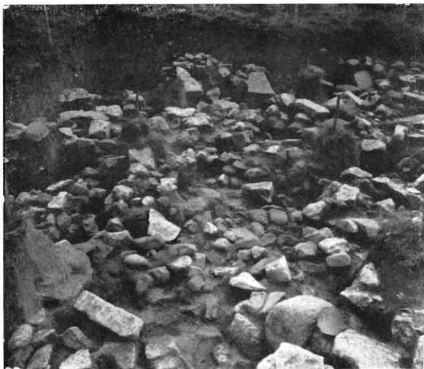
2. Pöide. Remains of a house. N part of excavation.