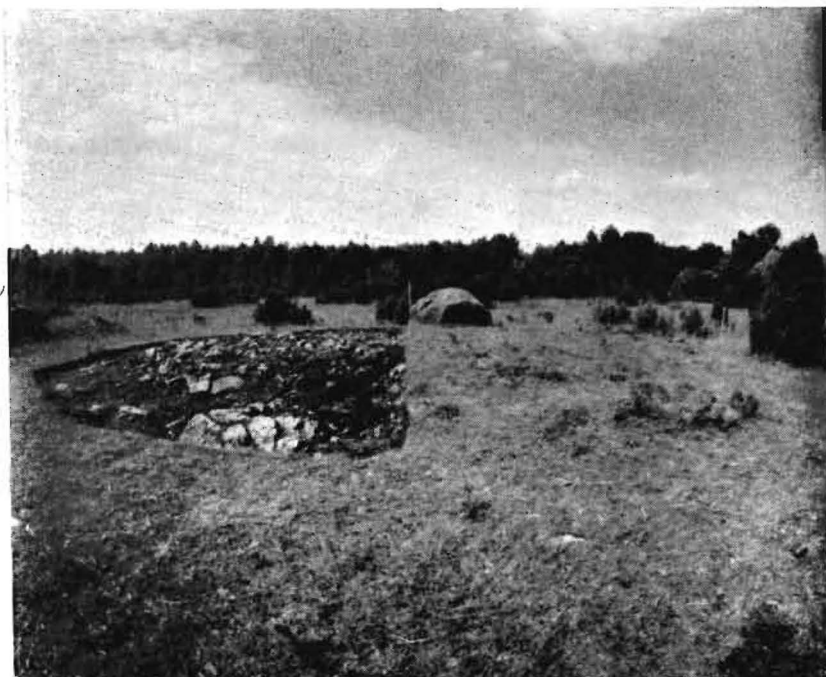
1. Kahutsi. Opening area from stone grave IV.