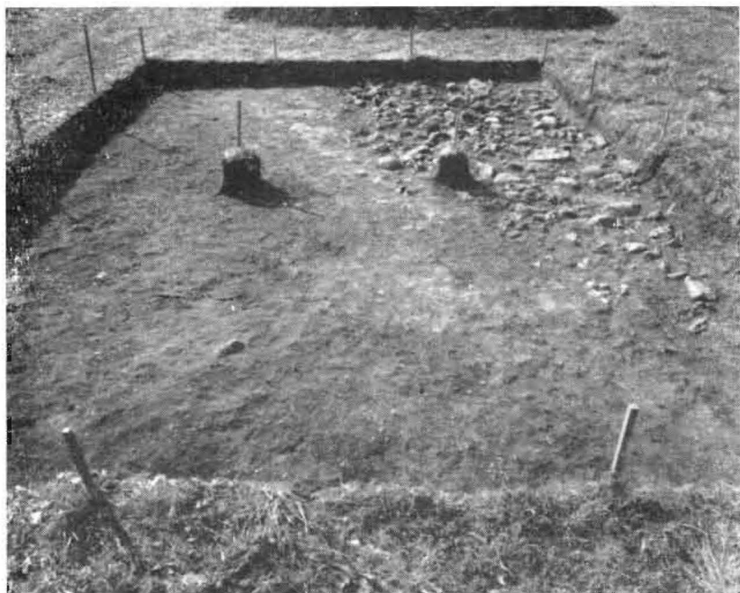
2. Kahutsi. Pavement from excavation B.