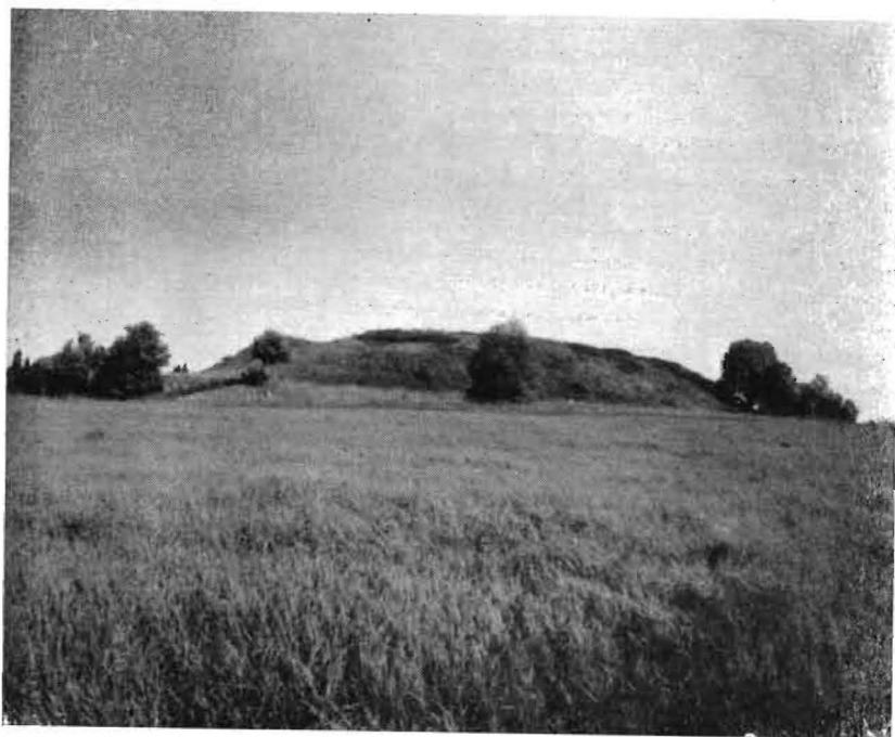
1. Pöide. Stronghold from NW.