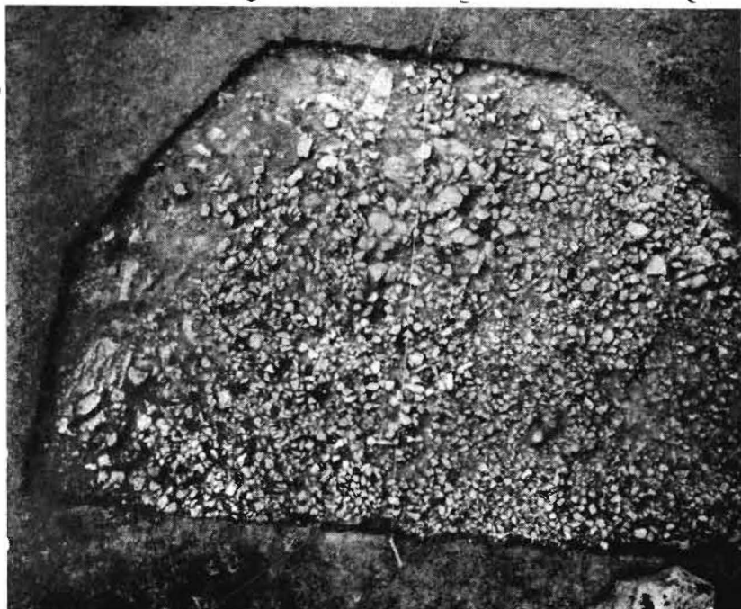
2. Kahutsi. The first layer of stone grave IV.