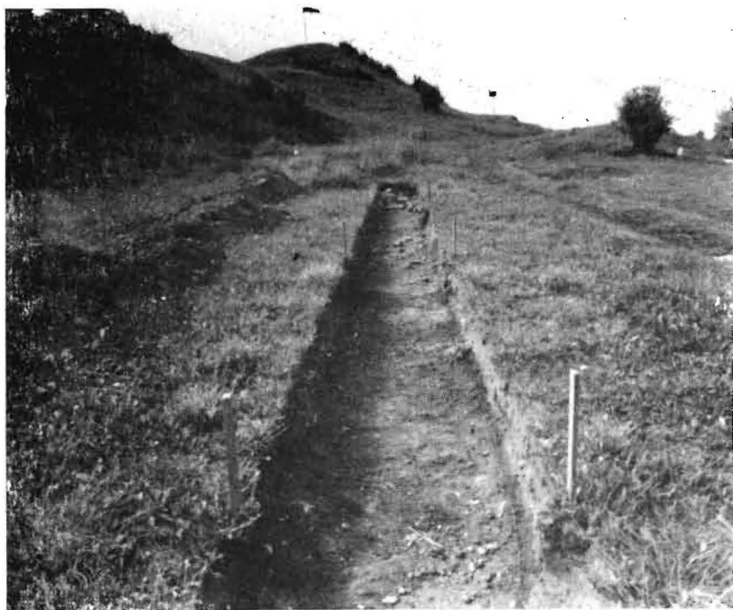
1. Kahutsi. Trial excavation (A) at the site of a settlement.