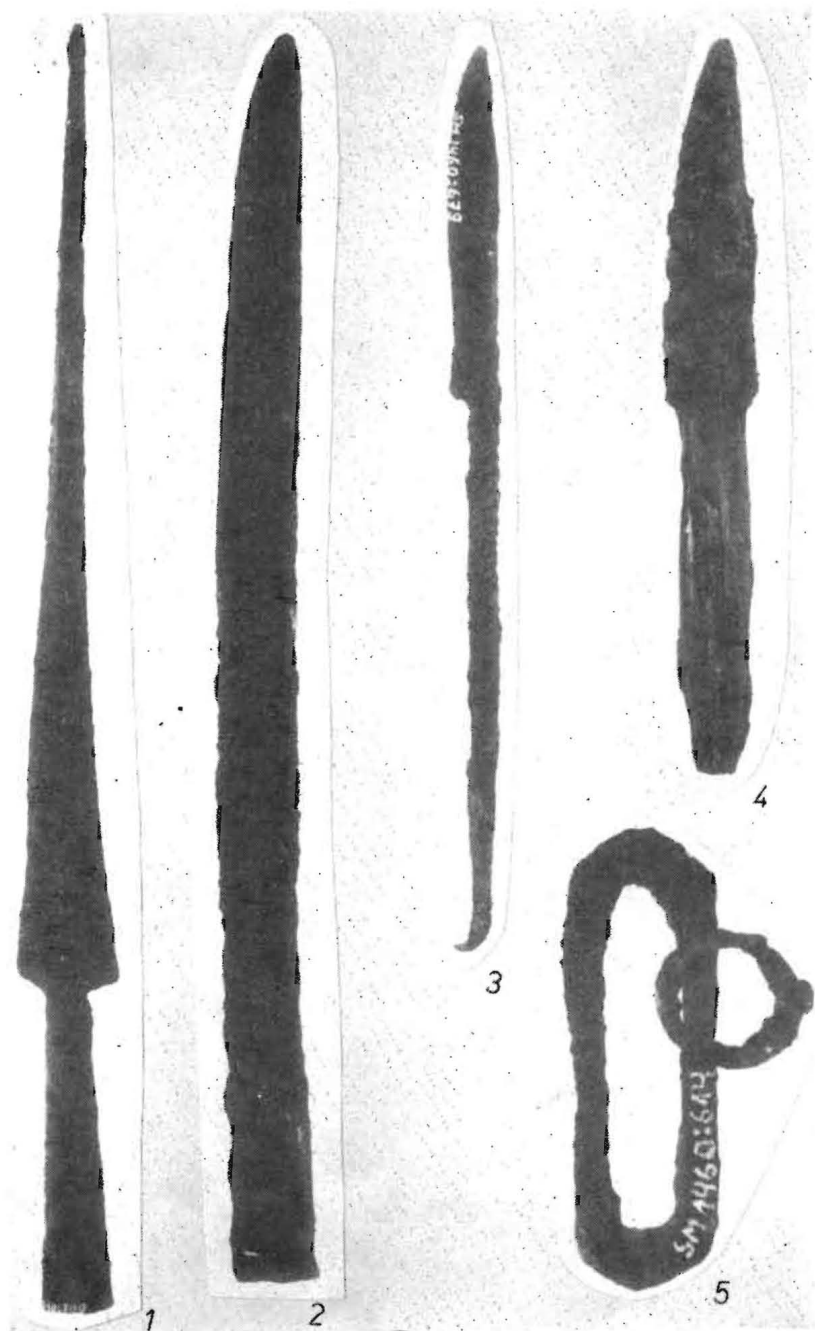
Pöide. Iron artefacts from stronghold. 1 spearhead, 2 blade of sword, 3 javelin, 4 knife with wooden haft, 5 fire-iron. (SM 1460: 700, 675, 679, 692, 614. — 1—3 ca 1:3, 4, 5 3:4.)