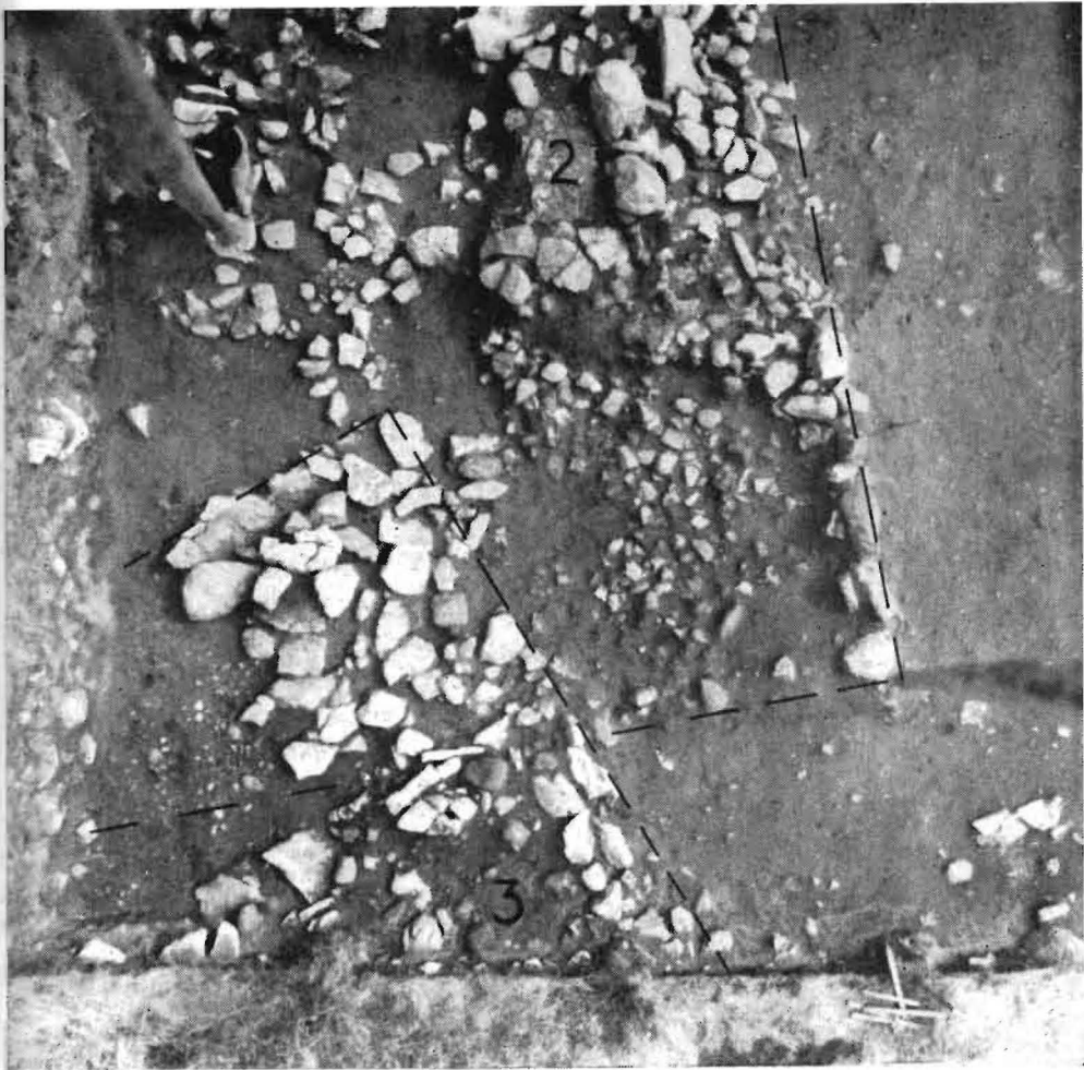
Pöide. Stoves nos. 2 and 3. Countours of buildings.